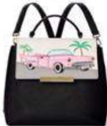
kate spade new york® backpack purse Pearl Level 19,200+ Total year-end Star Consultant contest credits

BE A CONSISTENT STAR CONSULTANT FOR ALL 4 QUARTERS STARTING JUNE 16, 2018-JUNE 15, 2019 AND YOU'LL BE ELIGIBLE TO PICK UP ONE OF THESE BEAUTIFUL PRIZES FROM THE KATE SPADE NEW YORK® COLLECTION WHEN YOU ATTEND SEMINAR 2019! PLUS, YOU'LL GET STANDING RECOGNITION AND BE INVITED TO A PRIZE PARTY AT SEMINAR!