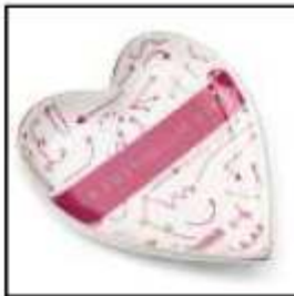
MK Trinket Tray