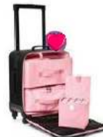
NEW MINI INSULATED CARRIER CASE

Place a combined $1800 ws order and EARN ALL PRIZES!