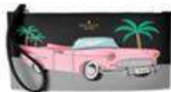
kate spade new york® wristlet Ruby Level 9,600-11,999 Total year-end Star Consultant contest credits