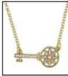
Company Key Necklace