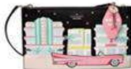
kate spade new york® crossbody Emerald Level 14,400-19,199 Total year-end Star Consultant contest credits