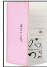
NEW MK Connection Tote