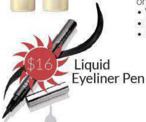
Liquid Eyeliner Pen