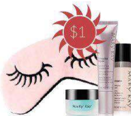
Beauty That Counts® Sleeping Eye Mask

$1 when you purchase one of the three products below.