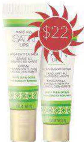
Satin Lips® Set White Tea & Citrus