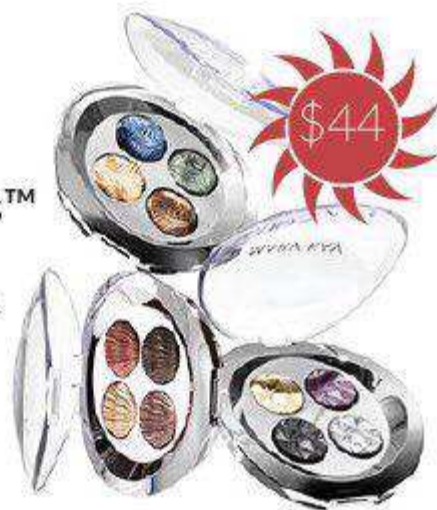
Limited-Edition Pure Dimensions™ Eye Palette

choose Maui Gardens, Paris Starlight and/or Moroccan Dunes