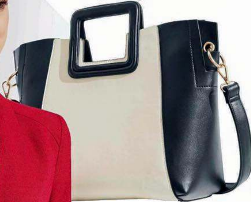
Black and White Tote