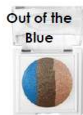
Out of the Blue