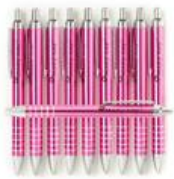
$350 combined wholesale order earn a Pkg 3 MK Pink Pens