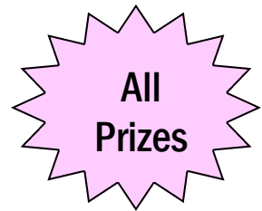
$1000 combined wholesale order All Prizes