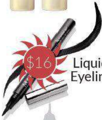
Liquid Eyeliner Pen