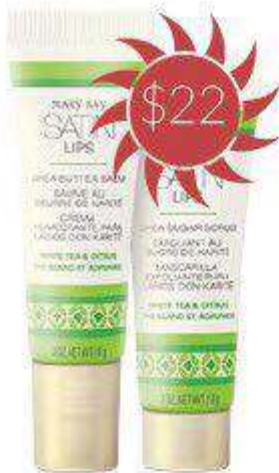
Satin Lips® Set White Tea & Citrus