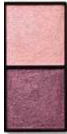
Pink & Purple