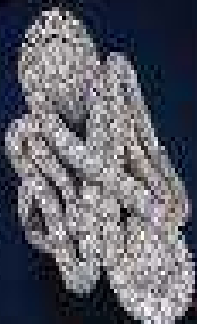
CIRCLE OF DIAMONDS REFLECTS MAGIC AND GLOW FROM MARY KAY

CIRCLE OF DIAMONDS REFLECTS MAGIC AND GLOW