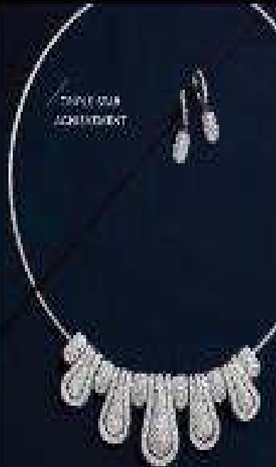
TRINKET OF THE COUNTRY FROM MARY KAY